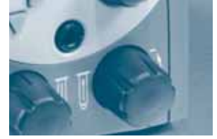
Vacuum knob ... ↑