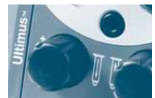
... Air pressure knob