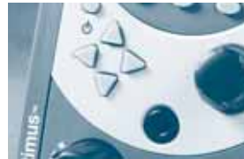
Front panel output air