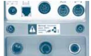
Back panel output air