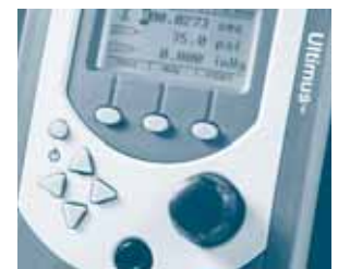
Timer knob . . . .

Once a single digit in the time row is selected, you can also use the timer dial (top right knob) to adjust the dispense time.